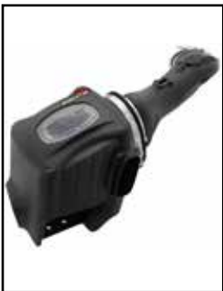
Momentum Intake System