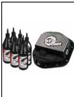
Front Differential Cover

P/N: 46-70082-WL (w/ Oil) 46-70082 (Black) 46-70080 (RAW)