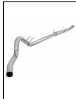
DP-Back Exhaust System

P/N: 49-03039 (w/ Muffler) 49-03039NM (No Muffler)