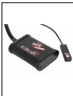
SCORCHER HD Module

P/N: 42-13041 (Full-Time) 42-13042 (Part-Time)