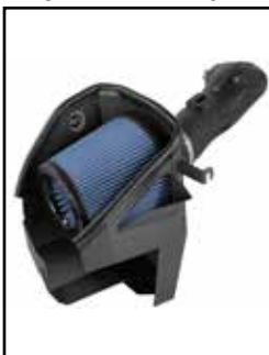
Stage-2 Air Intake System