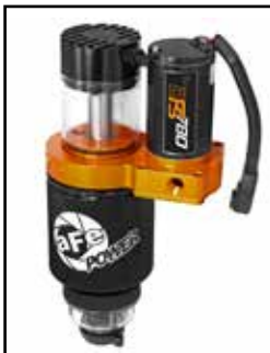
DFS Fuel System

P/N: 42-13041 (Full-Time) 42-13042 (Part-Time)