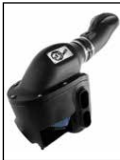
Stage-2 Si Intake System