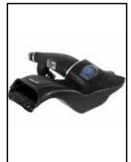
Momentum GT Air Intake

P/N: 51-73115 (PDS) 54-73115 (P5R) 75-73115 (PG7)