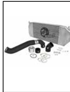
Intercooler w/ Tube