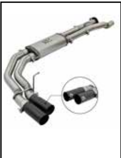
Side Exit Exhaust System

P/N: 49-43091-B (Blk. Tips) 49-43091-P (Pol. Tips)