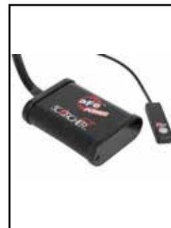
SCORCHER GT Module

P/N: 49-43045-B (Blk. Tips) 49-43045-P (Pol. Tips)