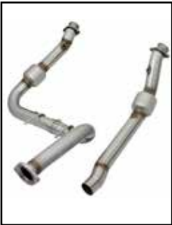
Twisted Steel Downpipes

P/N: 48-43020-HC (Street) 48-43020-HN (Race)