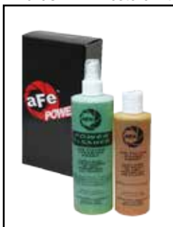
Pro-GUARD 7 Restore Kit