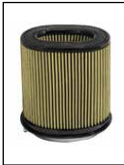
PRO GUARD 7