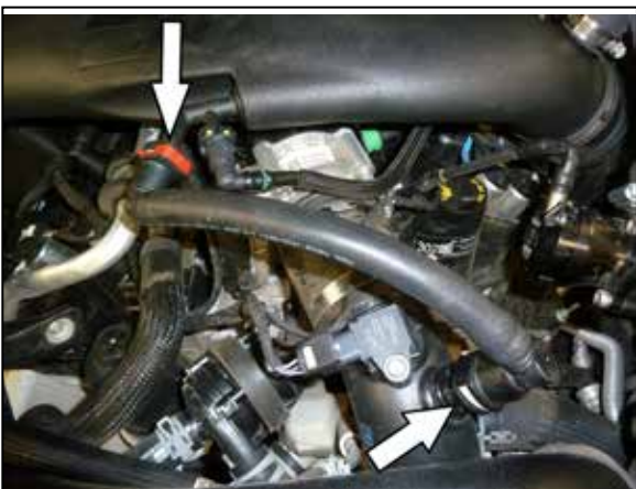
25. Connect the smaller vent line to the Ejector fitting installed into the K&N intake tube. Remove the two fittings from the larger factory vent line and install them into the vent hose provided. NOTE: Use a heat gun or hair drier to heat the vinyl line and ease the removal of the fittings from the factory line.

30. It will be necessary for all K&N® high flow intake systems to be checked periodically for realignment, clearance and tightening of all connections. Failure to follow the above instructions or proper maintenance may void warranty.