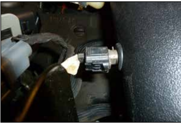
22. Reconnect the IAT sensor electrical connection.