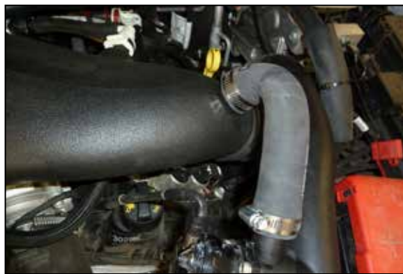
28. Install the provided BOV hose and secure with the provided hose clamps.