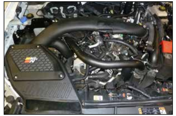
29. Reconnect the vehicle's negative battery cable. Double check to make sure everything is tight and properly positioned before starting the vehicle.