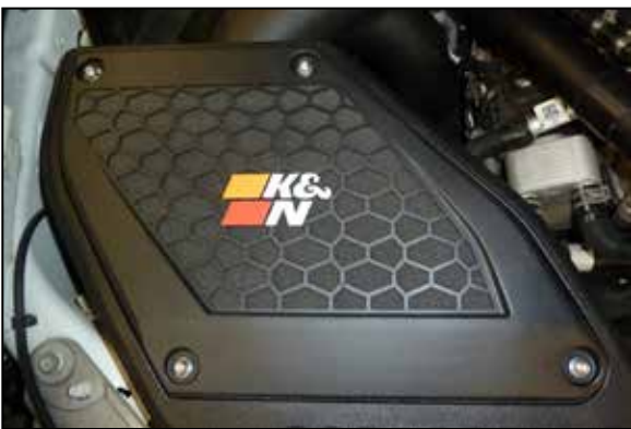
24. Assemble the filter housing lid and install it onto the K&N air filter housing using the provided hardware.