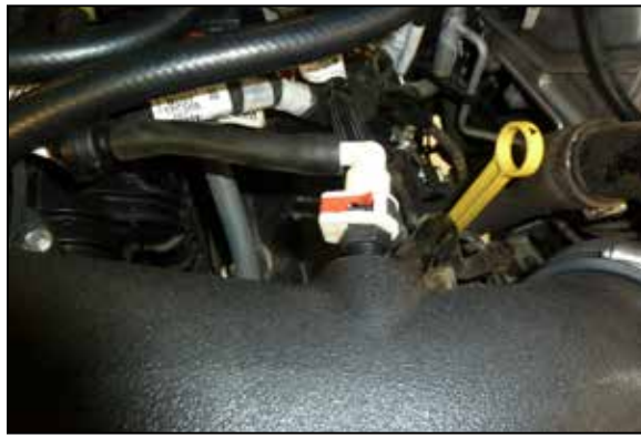
26. Connect the rear vent line to the quick connect fitting installed into the K&N intake tube.