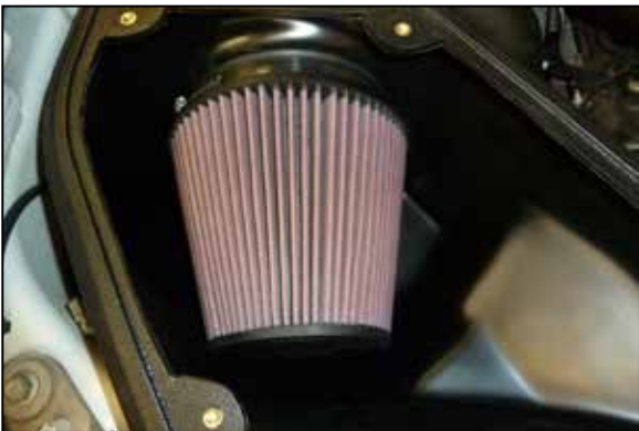
23. Install the K&N air filter onto the filter adapter and secure with the provided hose clamp.