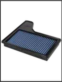
OE Replacement Air Filter