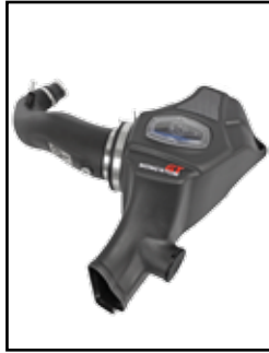
Cold Air Intake System