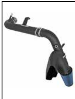
Cold Air Intake System

P/N: 48-33017-HC (Street) 48-33017-HN (Race)