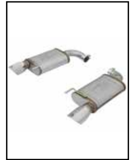
Axle-Back Exhaust System

P/N: 49-43085-B (Blk Tip) 49-43085-P (Pol Tip)