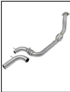
Twisted Steel Down-Pipes

P/N: 48-33017-HC (Street) 48-33017-HN (Race)