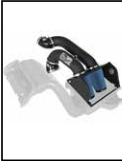
Cold Air Intake System