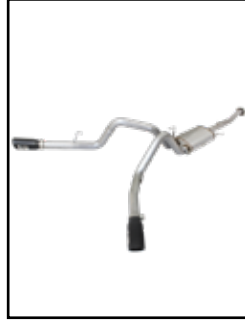
Cat-Back Dual Exhaust System

P/N: 49-43070-B (Blk Tip) 49-43070-P (Pol Tip)