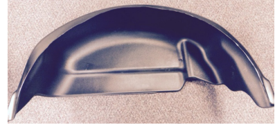
Wheel Well Guard Passenger's Side (1)