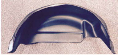
Wheel Well Guard Driver's Side (1)