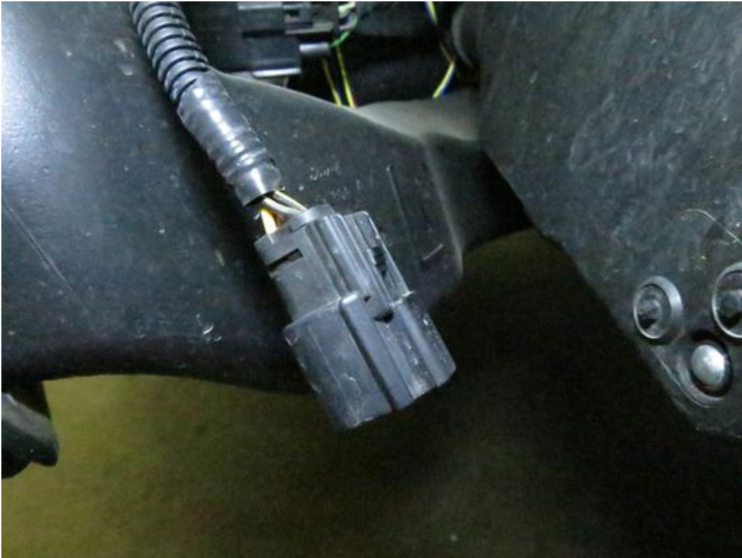
9. Unclip the bumper support cover from the bumper beam and move it out of the way.