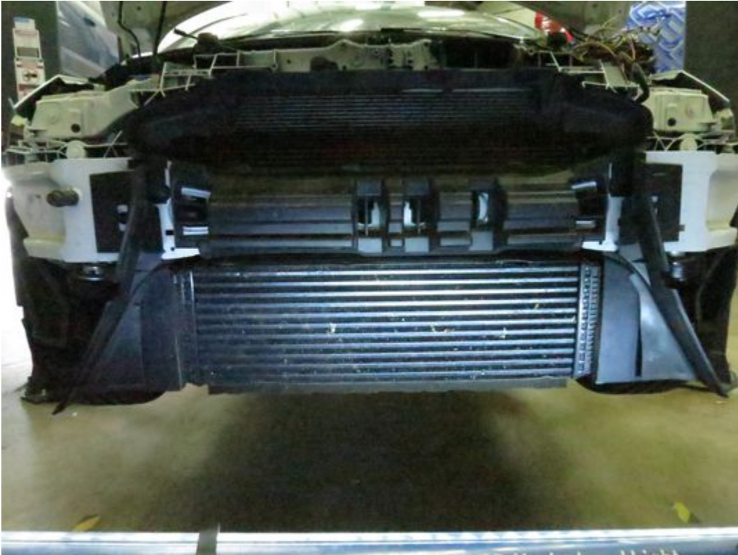
10. Remove the radiator cowling by squeezing the clips inside of the bumper support and unbolting the two T20 screws