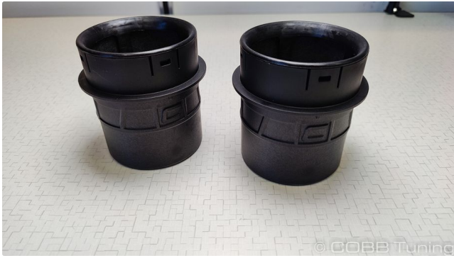
▼ 3" Silicone Coupler