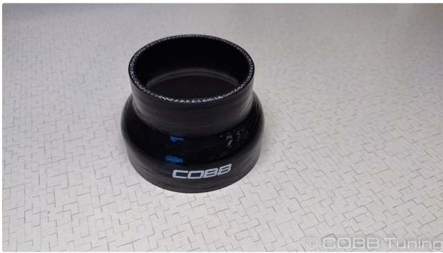
▼ (2) 3" Angled Coupler