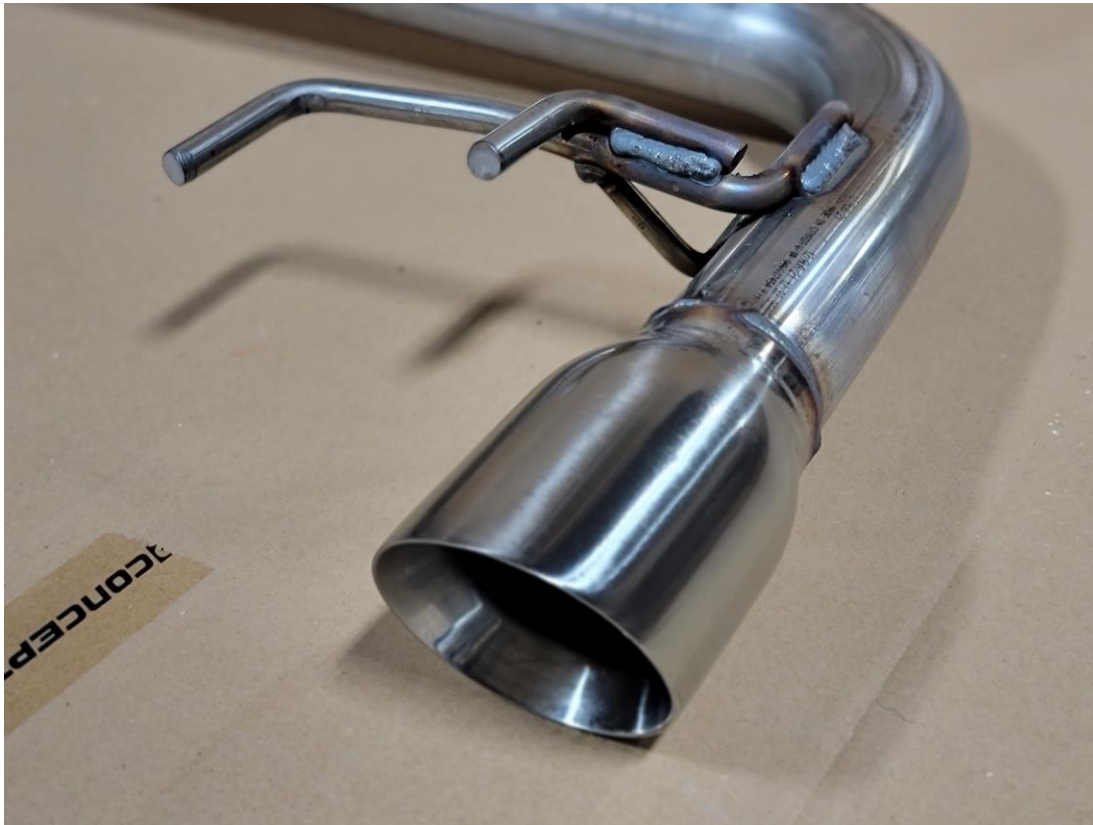
Figure 3 -Passenger Side Exhaust Tip with Hangers for the 2.3L and 2.7L

Step #3 – Once alignment has been confirmed, tighten down both exhaust clamp points. You are now ready to test drive your new King of the Hill Dual tip Axle-back. During your first test drive a heat cycle will begin causing the expansion and contraction of your new Axle-back system. It is advised to retighten the exhaust clamps after 30 miles of driving to ensure proper fitment.