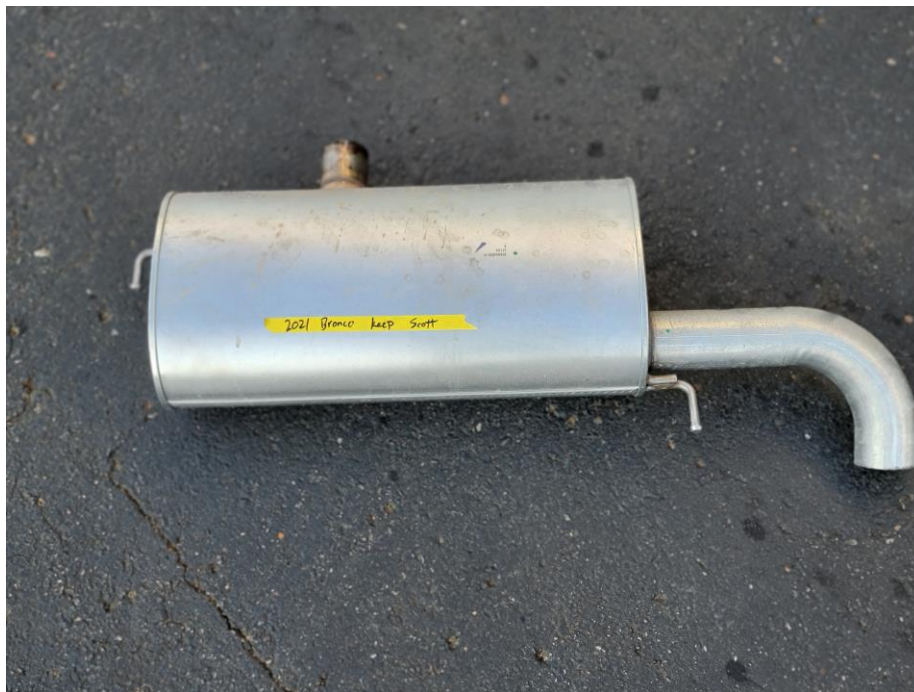
Figure 1 – Stock Bronco Muffler