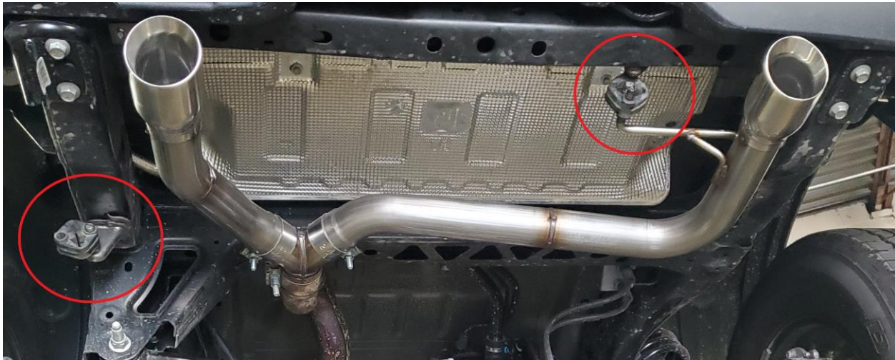
Figure 2 – Circled – Factory Rubber Isolator Locations - **The passenger side isolator location on the 2.3L and 2.7L may vary but MRT has designed our systems with that in mind. The Passenger side hanger has two points to fit both passenger side factory isolator points with ease. **

Step #1 – Making sure the original exhaust clamp is attached to the remaining factory over axle tubing. Connect the open end of the combination Y-Pipe and driver side tailpipe tubing to the outlet of the original factory exhaust system. Verify alignment of the exhaust hanger and driver side rubber isolator.