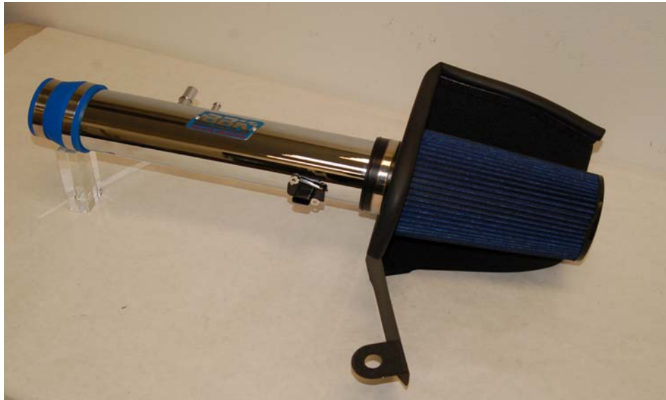
Complete cold air intake shown assembled