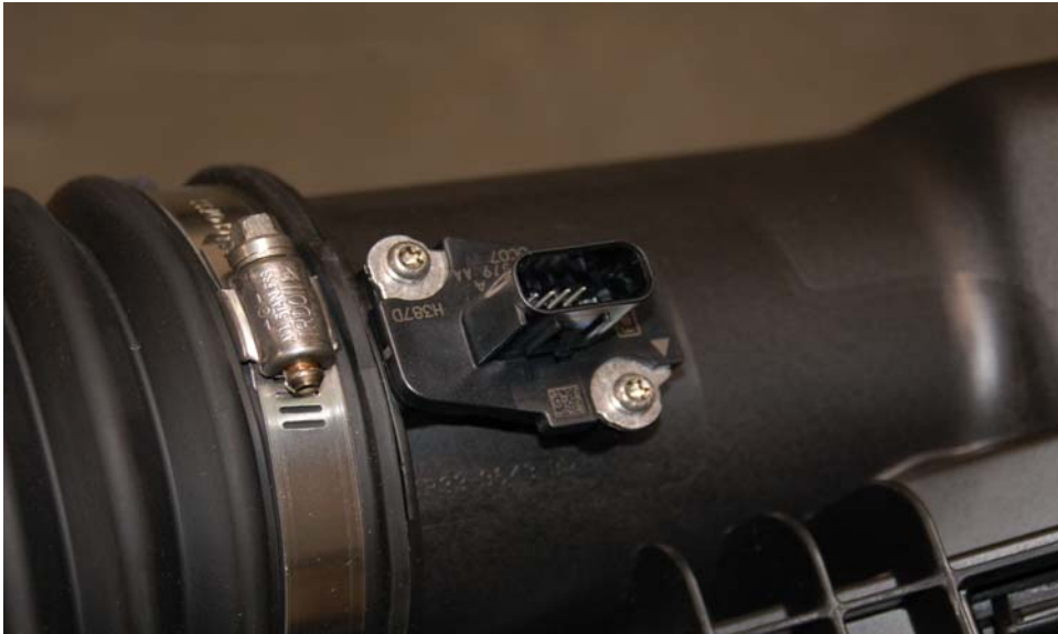
Fig. 6 Remove Mass Air Sensor from air box cover. Use a Torx T20 screwdriver.