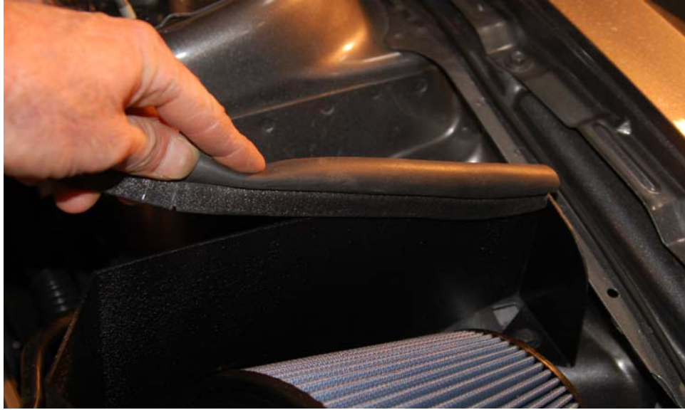
Fig. 7 Installing sponge seal to top of filter shield.