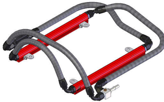
Example of “returnless” fuel system plumbing