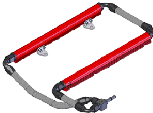
Example of a returnless fuel system plumbing