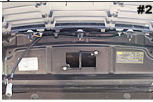
Position bracket and tighten the 10mm nuts.