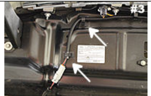
Secure wiring behind the grille with included adhesive backed clips.