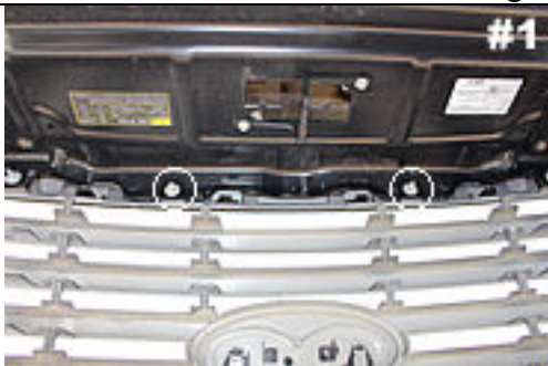
Remove 10mm nuts on backside of grille above the Ford emblem.