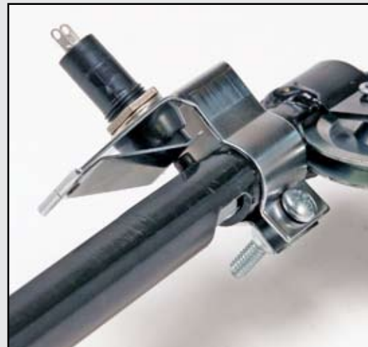
Parking Brake Warning Light Switch properly mounted on the brake handle assembly

Note: The time the light remains on will vary between 15 to 45 seconds. If the light fails to shut off, check the ground connectors. Starting the car repeatedly in a short period of time, may cause the light to shut off faster. In very hot conditions the light may remain on for a longer period of time, or not shut off at all. When the car is cooled again, the switch should work properly. Although this is not a thermal type switch, the expansion and contraction of the insulating material in the box will affect the time.