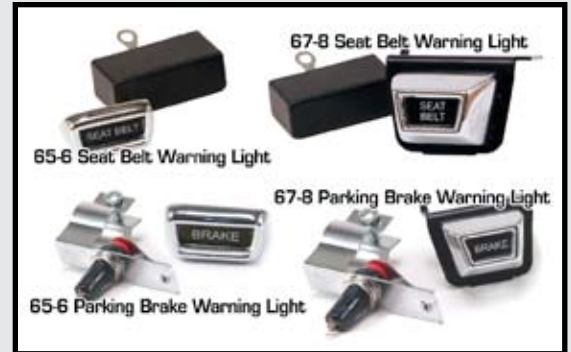
Under Dash Warning Lights

After securing the light, secure the black wire (with the loop connector) to a ground under the dash. Make sure the wire has good metal-to-metal contact. If, in the case of the 1967-8 bracket, you choose to mount the ground wire under the bracket (between the bracket and the dash), remove a small area of paint where the ground connector will touch the bracket to ensure good contact.