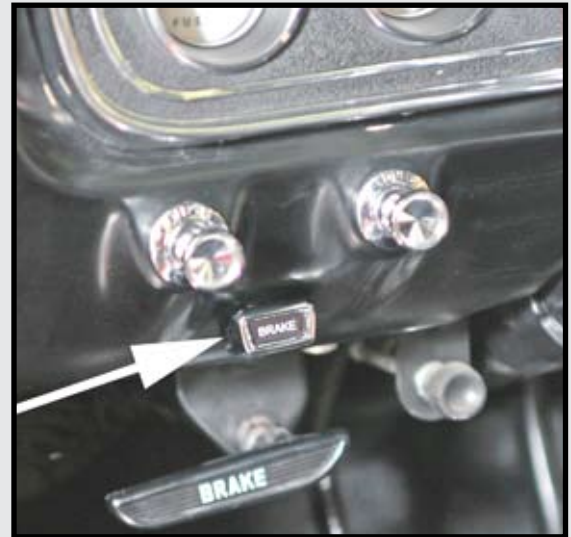
Proper location for 64-66 Parking Brake Warning Light