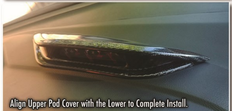
Align Upper Pod Cover with the Lower to Complete Install.