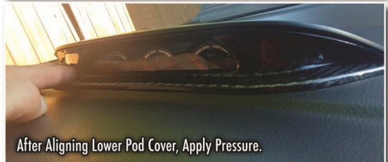
After Aligning Lower Pod Cover, Apply Pressure.