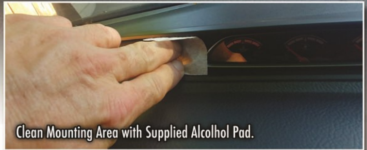
Clean Mounting Area with Supplied Alcohol Pad.

Features: Carbon Fiber 2x2 Carbon Weave High-Gloss Finish 3K with UV Protection Precise Fitment Easy Install