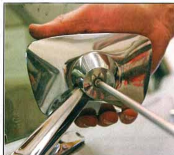
Figure 3: Adjusting the mirror head

If the mirror will not adjust to the proper angle after installation, the mirror head will need to be adjusted. To do this, carefully loosen the chrome screw at the back of the mirror head. Do not remove the screw, only loosen it. Move the entire head slightly on the pivot and tighten the screw. Check position. Repeat as required. At no time should the mirror head be adjusted without first loosening the screw. (Figure 3)