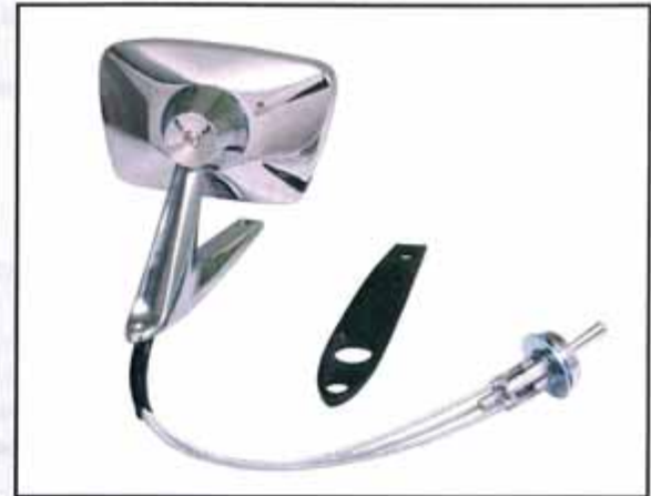
Figure 1: Make sure mirror clears vent window

Position the control cables in front of the window channel. Check to make sure that the cables window operation. Note that the back of the door has a perforated hole for the remote control assembly. Carefully cut out the hole and install the control assembly with the retaining washer on the back of the door panel.