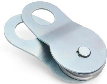
Part # RS125-Snatch Block