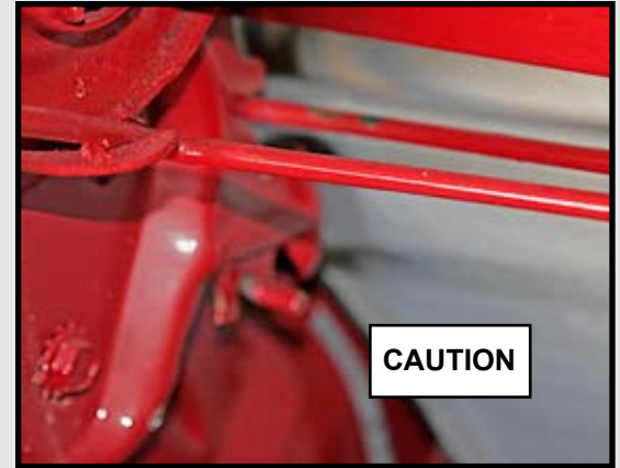
Figure 4A: Do not reposition trunk rods without correct tools.

We do not recommend that the rods be repositioned without the correct tool. These rods are under a great deal of tension. Injury may result if handled improperly. Consult an expert if you are not familiar with this process. In some cases, the torsion bars are positioned at the lightest setting. If the trunk lid is flying open and there is no further adjustment available. You may consider adding weight to the lid. Cars with luggage racks or rear spoilers on the trunk lids may not "pop" open. Adjusting the torsion bars may help.