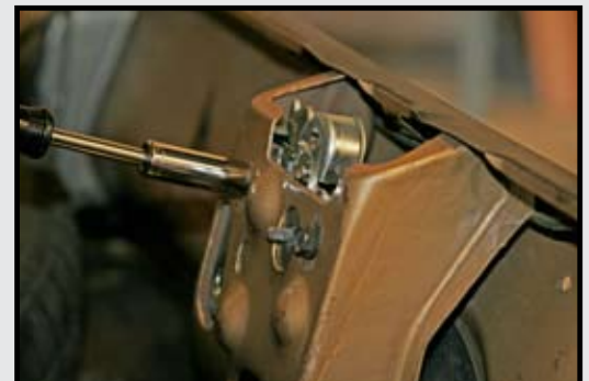
Figure 1B: Mounting the new electric trunk latch on a 1967-68 Mustang.