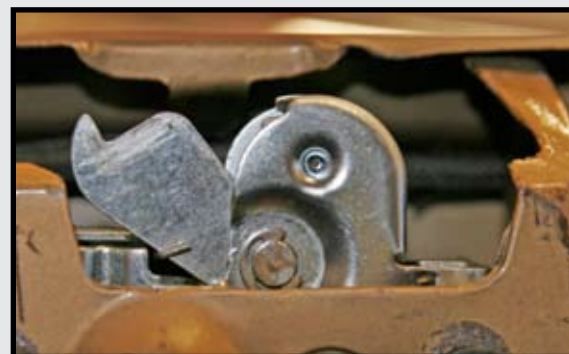
Figure 3A: Note the clearance on the trunk latch when checking the installation.