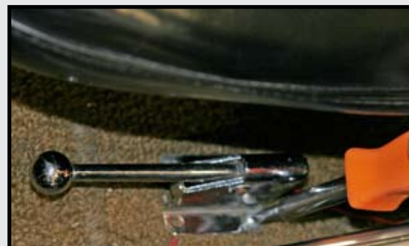
Figure 2A: Securing the trunk release lever.

With the trunk lid closed, pull up on the release lever. (Figure 3A) Only a light "One Finger" pull is required. If you wired the release to function only with the ignition on, make sure the ignition is on. The trunk lid should pop up about three inches. If the release is not functioning, check all electrical connections, the ground and power