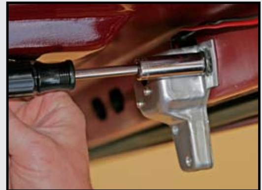
Figure 1A: Mounting the new electric trunk latch on a 1965-66 Mustang.