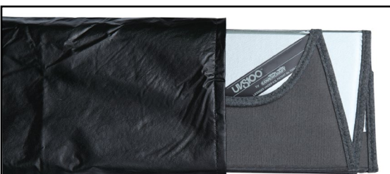
(Optional storage bag shown)

For more instructions and "How To" videos, visit Covercraft's YouTube Channel: www.youtube.com/covercraft1965