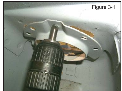
Figure 3-1 applies only to vehicles using carriage bolts to secure the factory upper shock mount.

Note: Fairlane shock towers use a slightly different bolt pattern and must be drilled to match the adapter and backup plates. Structural integrity is maintained through use of the backup plate.