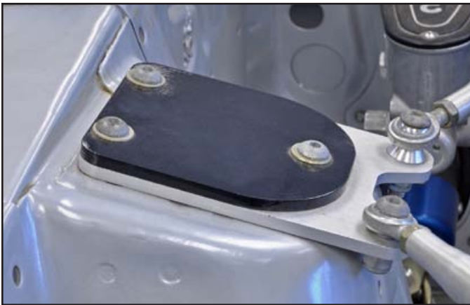
Full Coil-Over mounted ABOVE - standard ride height