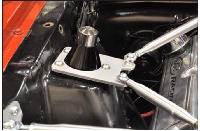
Bolt-On Coil-Over mounted BELOW - standard ride height

Placing the coil-over mount ABOVE the tower-brace plate lowers the ride height approximately 1/2".