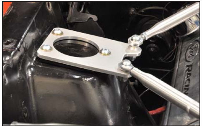
Full Coil-Over mounted BELOW - lowered ride-height