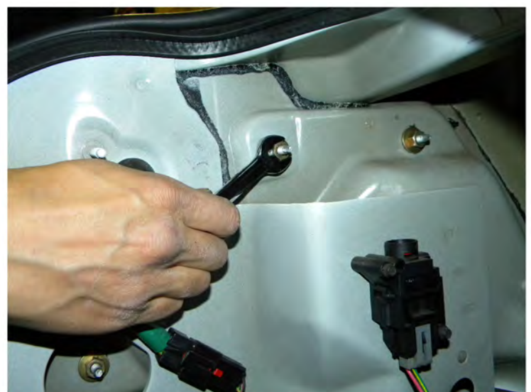
14. Tighten the (4) 11mm nuts