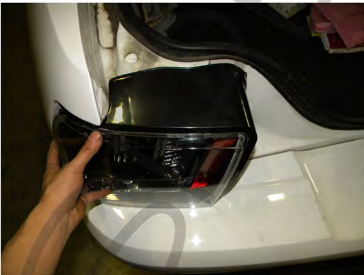
15. Place the LED tail light into the stock location