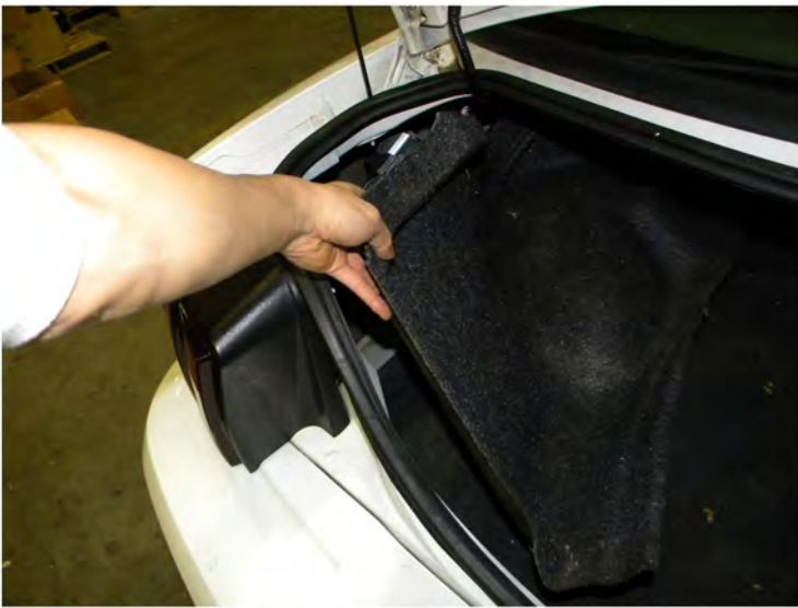
17. Replace the side trunk liner