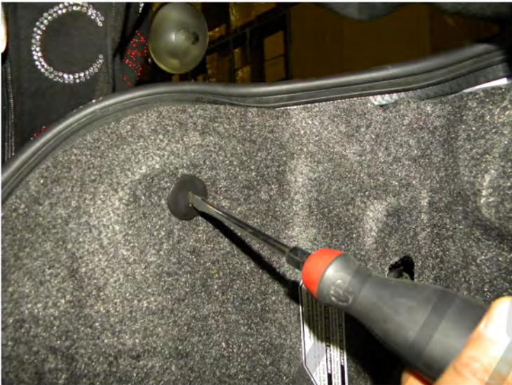
19. Tighten the plastic flat head clip