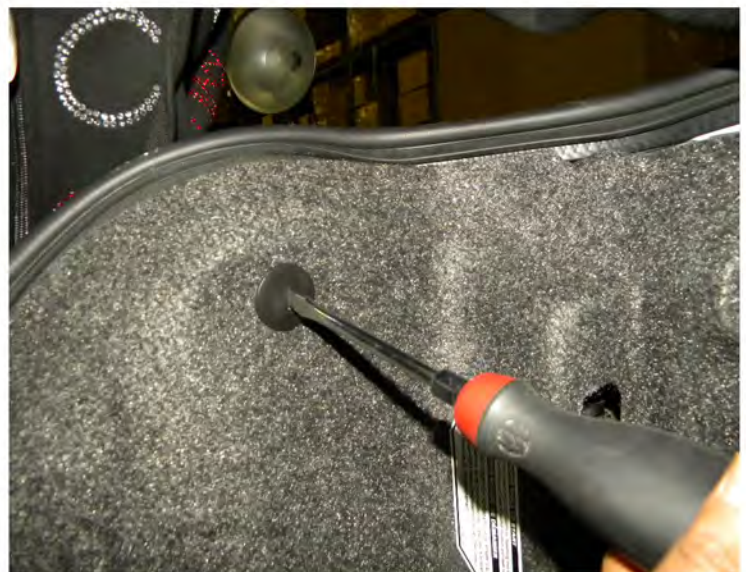
4. Remove the plastic flat head clip