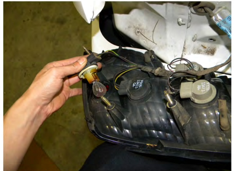
10. Remove the light harness and the bulbs