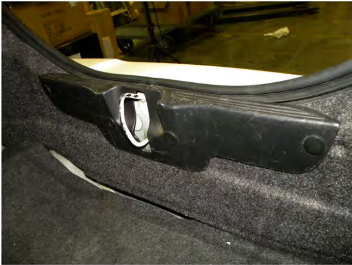
1. (4) plastic clips location

Do not make direct contact with the halogen bulbs or the wire assembly until the unit has cooled down after use.