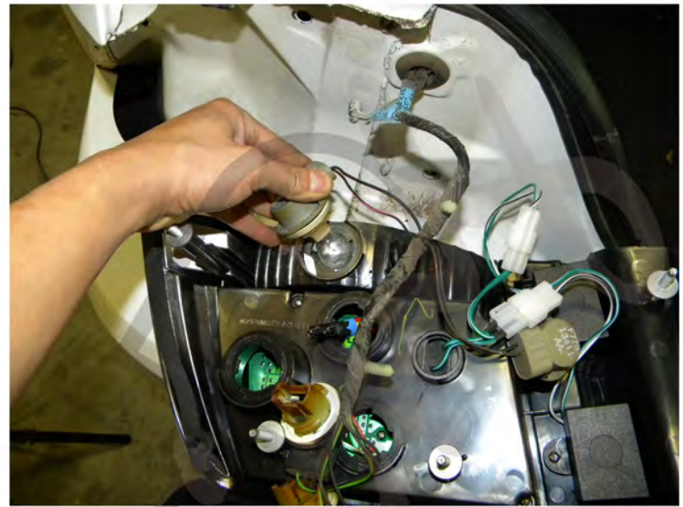
12. Plug the tail light harness into the LED tail light