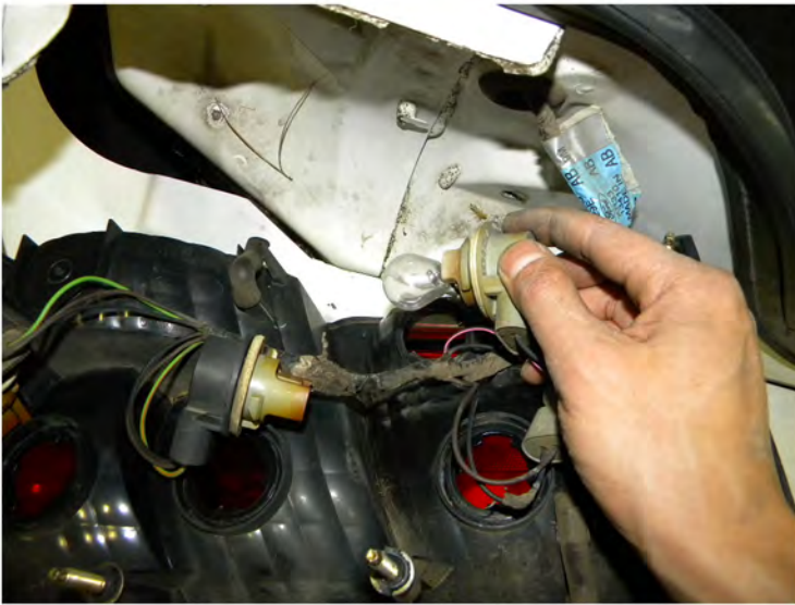
11. Leave the reverse light bulb in the socket please see the " L.E.D. tail lights installation instruction" If your tail lights don't have L.E.D. You can skip the installation instruction.