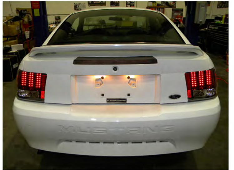
22. The installation is now complete