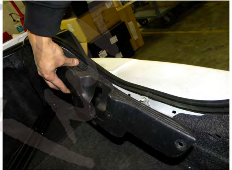
20. Replace the plastic molding and secure it with the (4) plastic clips