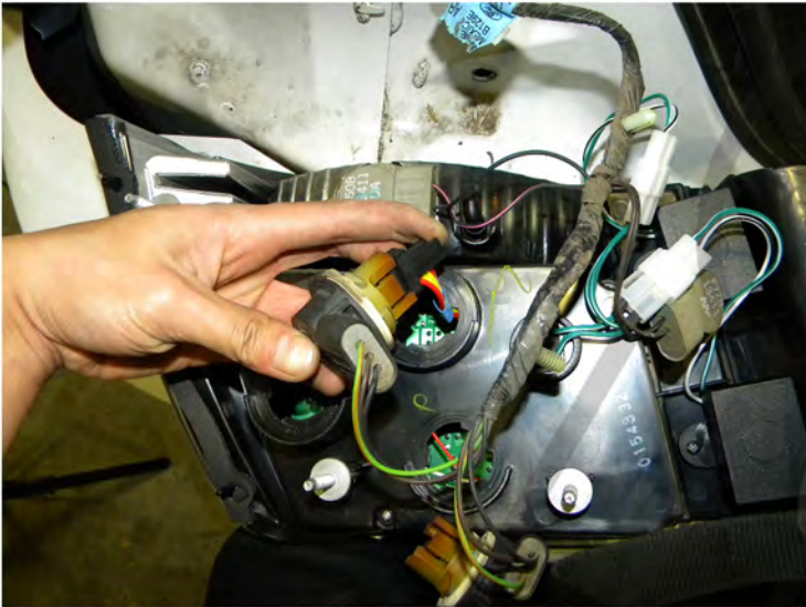
13. Plug the tail light harness into the LED tail light