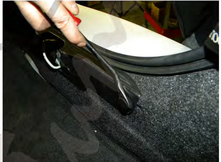
2. Remove the (4) plastic clips