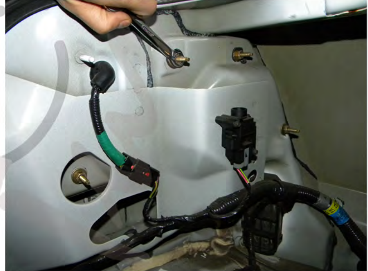
8. Remove the (4) 11mm nuts