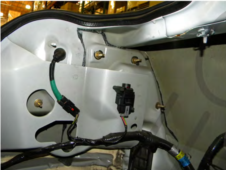
7. (4) 11mm nuts location