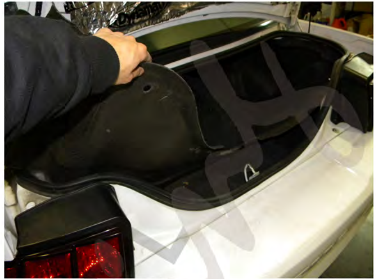
18. Replace the rear trunk liner