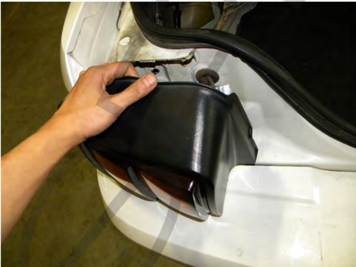
9. Remove the tail light