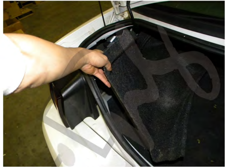
6. Remove the side trunk liner