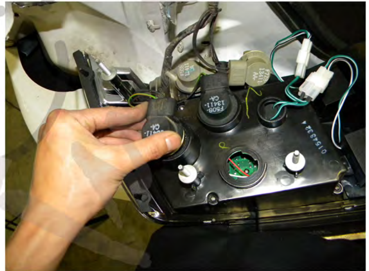
14. Plug the tail light harness into the LED tail light