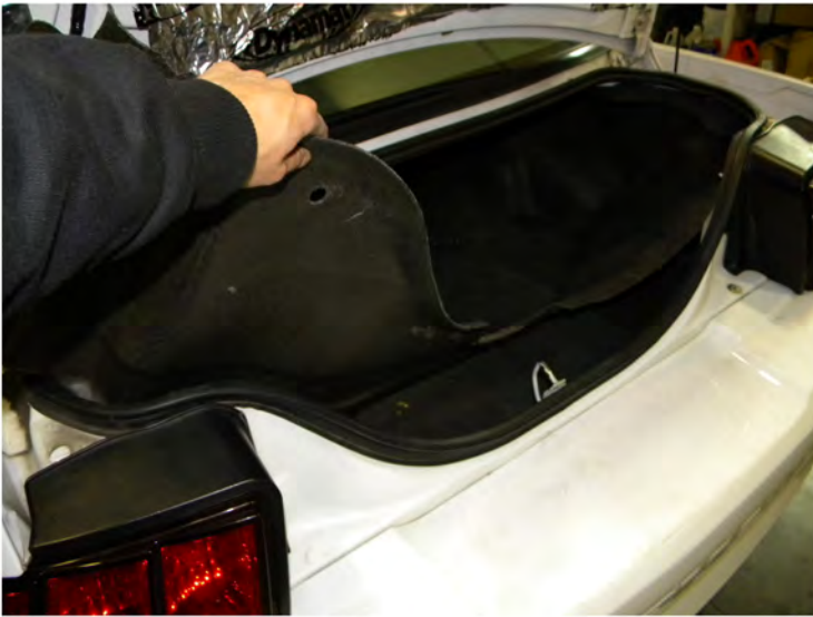
5. Remove the rear trunk liner