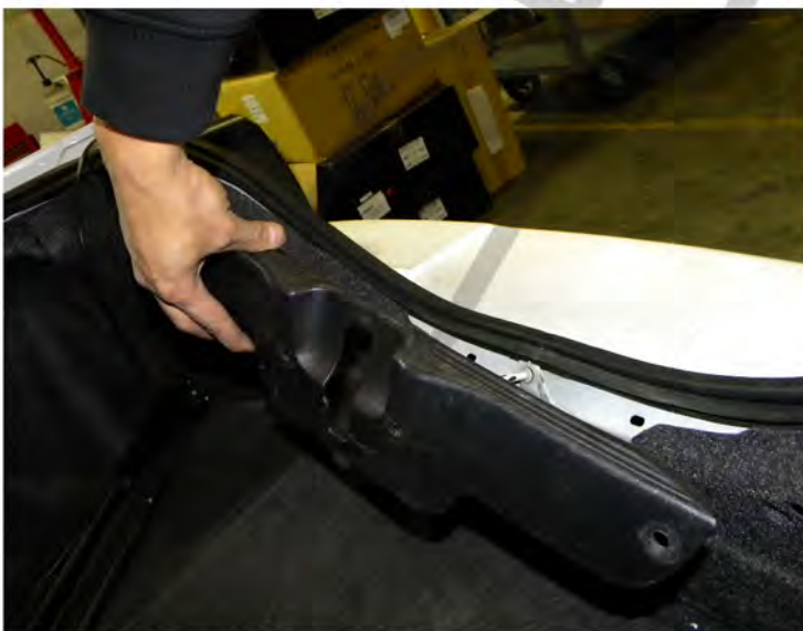
3. Remove the plastic moulding