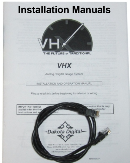
(1) 36" CAT5 Cable